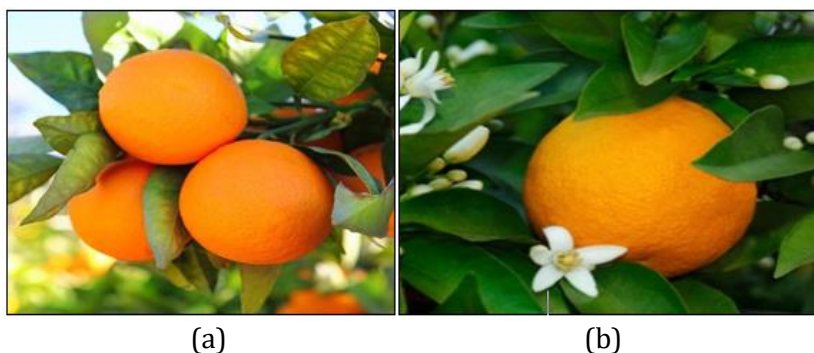
Fig. 2. a) Sweet orange fruit; b) White five-petaled flower

It is found to be most cultivated fruit tree in the world. The fruits of orange tree can be eaten or processed to have its juice or fragrant peel. Sweet orange trees often reaches up to 6 meters (20 feet) height. They have medium sized and ovate, broad, glossy evergreen leaves with petioles having narrow wing. Its usual shape and color is round and pulp orange but there are variations also ( Figure 2 ).